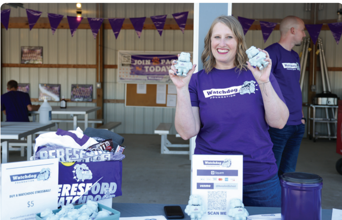
Members of the Watchdog Foundation team selling stress dog Watchdogs.

The Watchdog Education Foundation hosted their annual Homecoming/Community Pork Loin Barbeque tailgate during Beresford High School's (BHS) Homecoming festivities! The tailgate was a big hit for the community, hosting over 450 people in the two-hour period. All proceeds from the free-will donation event support the Watchdog Foundation and the great activities they sponsor year-round. We were able to raise $2,150 towards their mission to assist and advance our community's pursuit of excellence, create lifelong connections, and build strong and mutually beneficial ties between the Beresford School District, the community, and its diverse alumni.